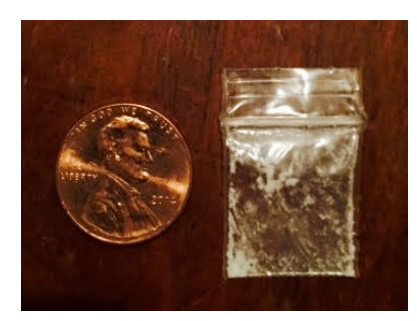
A little baggie of fentanyl residue (confirmed in lab) from San Francisco, 2015